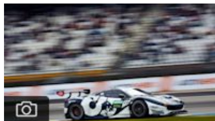
DTM at Hockenheimring, Germany on October 3, 2021