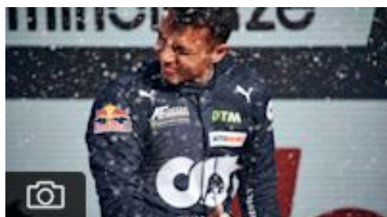
DTM at Hockenheimring, Germany on October 2, 2021