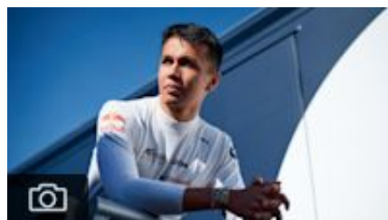
DTM at Hockenheimring, Germany on October 1, 2021